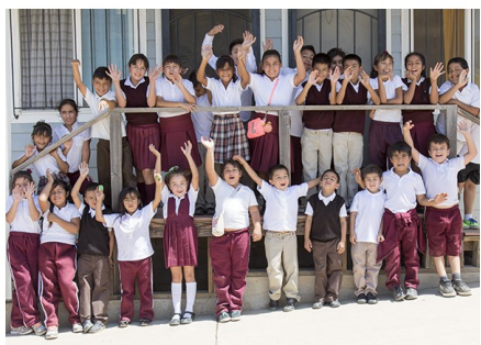
Some of the kids say "Thank you!" for the uniforms.

In case you are wondering, through your giving, we provide school uniforms and school supplies to